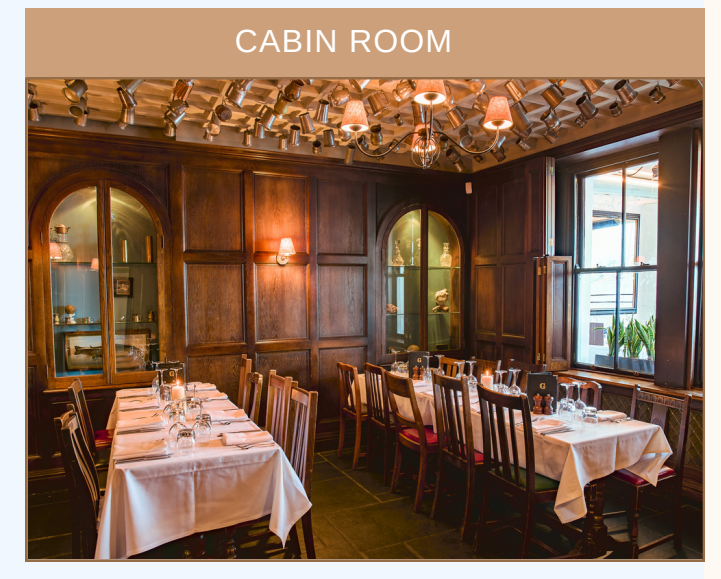
Capacity: 22 seated/ 24 standing