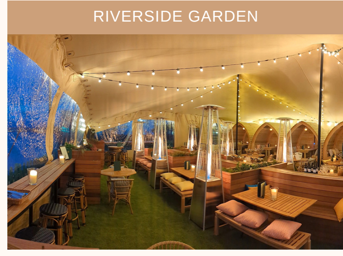
Capacity: 190 standing