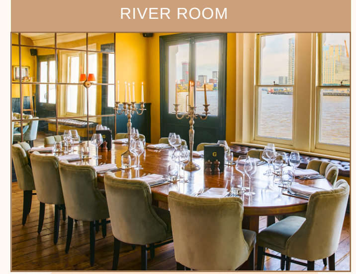
Capacity: 16 seated

Minimum spends to be discussed with the Events Manager