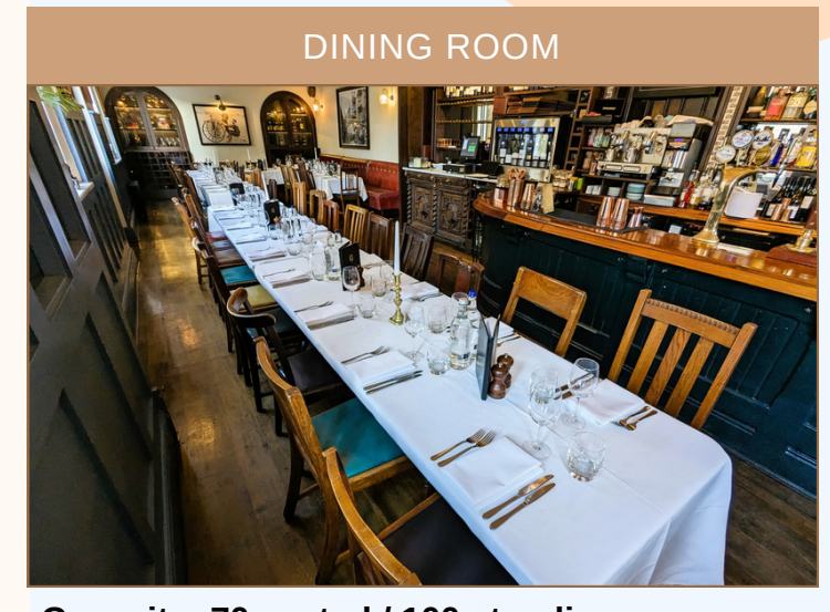
Capacity: 70 seated / 100 standing

Minimum spends to be discussed with the Events Manager